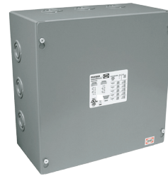
PSH300A Shown With Cover