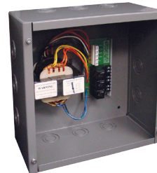
PSH300A Shown Without Cover